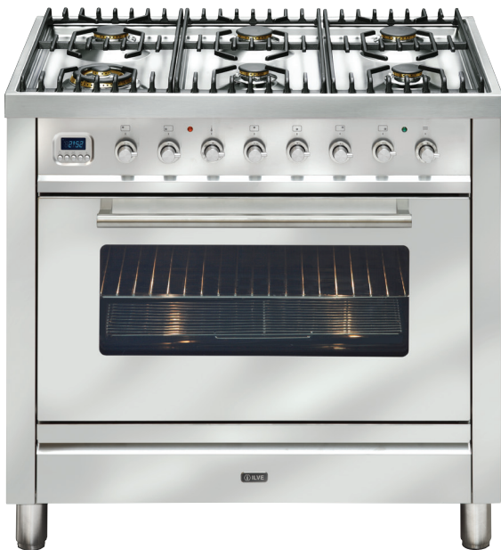
Pictured: NT906WMP/I Cooker in Stainless Steel

ILVE uses our own burner design. Production of the Venturi is horizontal, as used in the professional cookers. The primary air can be adjusted meaning the cooktop can be used with all types of gas. The air:gas ratio is optimised and the flame can be adjusted. This has a great positive impact in lower emission of CO (carbon monoxide) gasses well up to 1/100 compared with the reference standard. ILVE brass burners combine technical precision with performance. Our new Triple ring design guarantees scorching heat is achieved in an instant. Great for Wok cooking, boiling and grilling.